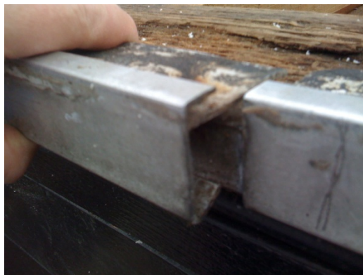
Original trim detail. Vertical depth 36mm.