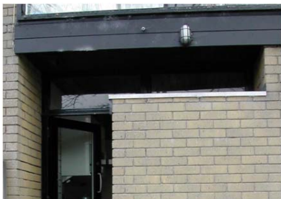
Trim over store.