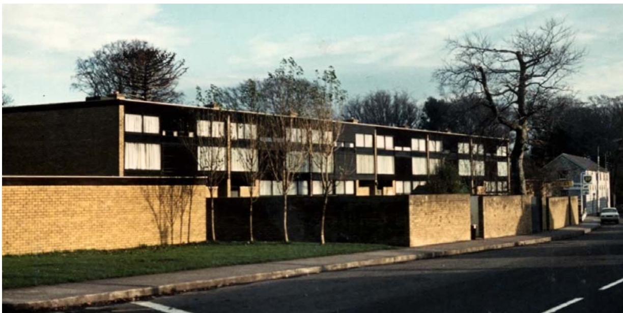
The continuous aluminium roof edge trim binds together the individual house and garage terraces giving a contrasting clean termination to the timber cladding. (Photo 1980's).

The adoption of a single approach to the roof trim over coming decades would have a unifying effect on the properties, tidying them up significantly.